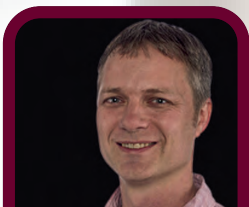
Interim Associate Provost for Online, Professional, and Engaged Learning, Univ. of Illinois - Springfield