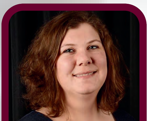
Instruction Specialist, Center for Online Learning, Research, and Service, University of Illinois - Springfield